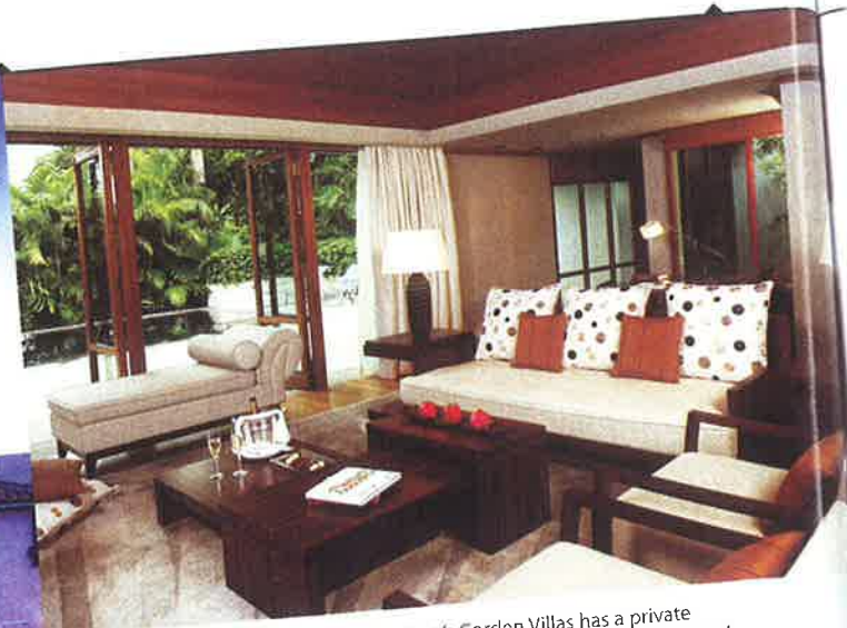
CLOCKWISE FROM ABOVE: Each of the Sentosa's Garden Villas has a private pool and garden terrace; visitors to Ojai Valley Inn can golf on the property's championship course, which has been played by golf legends Arnold Palmer, Gary Player, and Chi Chi Rodriguez; Ojai Resort's 31,000 square foot spa village offers guests a uniquely rejuvenating retreat.