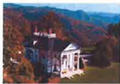
Westglow Resort and Spa Blowing Rock, NC