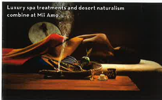
Luxury spa treatments and desert naturalism combine at Mii Amo.

This red-rock haven in magical Sedona is an intimate enclave of just 16 rooms within the larger Enchantment Resort. Indigenous Native American culture imbues the programs. A winter-solstice celebration December 18-21 features traditional Native American ceremonies. Explore the red-rock landscape of surrounding Boynton Canyon, or participate in traditional healing and spiritual practices such as the pipe ceremony and the sweat lodge. 888-749-2137, www.miiamo.com