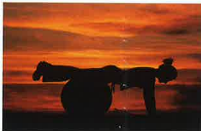
Trip hosts at Pure Kauai keep visitors active.