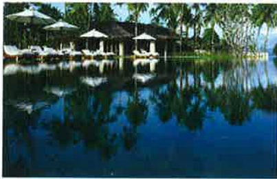
The environment at Six Senses focuses on peaceful relaxation.

best spas, even when they're a long haul away. Hot-stone massage or Mother Yoga? Ayurvedic or Western pampering? Here are some must-visit destination spas.