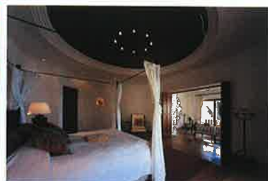
The accommodations, as well as the spa, at Maroma are the height of luxury.